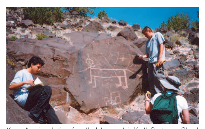
Young American Indians from the Intermountain Youth Center use Global Positioning Systems (GPS), digital photography, and written documentation to inventory rock art on the boulders and cliffs of Black Mesa near Velarde, New Mexico.

BLM experienced its greatest growth during the 1970s. The National Environmental Policy Act ushered in an entirely