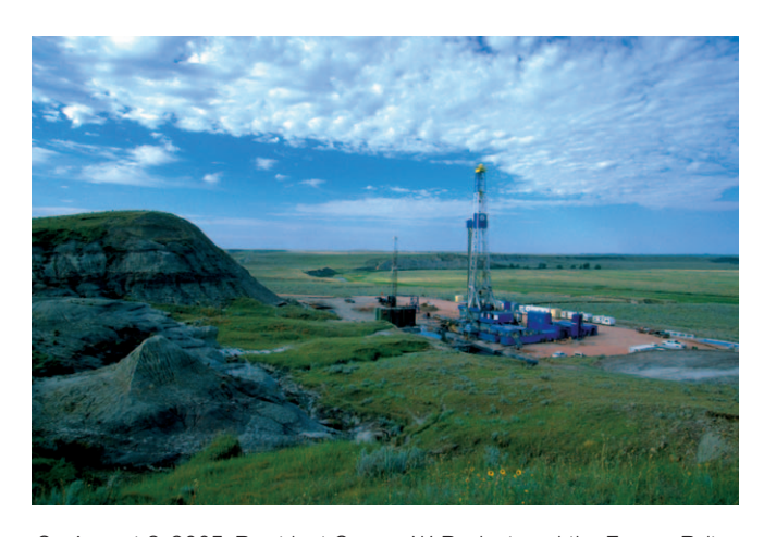
On August 8, 2005, President George W. Bush signed the Energy Policy Act of 2005, a significant piece of legislation for BLM. In recent years, on-shore Federal mineral lands have produced about 40% of the Nation's coal, 10% of its natural gas, and 5% of its oil.

vate sector, State and local government, promote dependable, affordable, and environmentally sound production and distribution of energy for the future." Technological advances, resource protection measures, and regulatory tools will enable energy development in an environmentally sensitive manner.