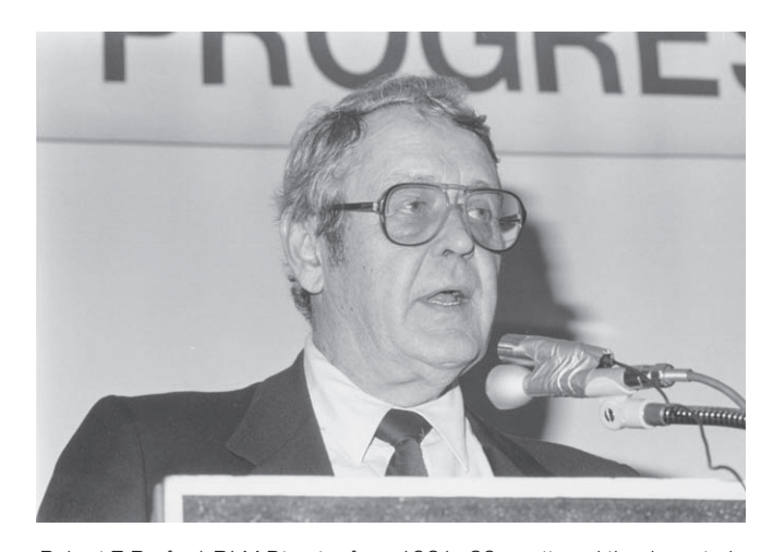
Robert F. Burford, BLM Director from 1981—89, continued the decentralization of BLM operations to the field and implemented a "good neighbor" program to improve cooperation with land users, conservation groups, and State governments. BLM field activities were consolidated to cut down on duplication in renewable resource programs. Burford's 1987 policy for managing riparian areas recognized them as "unique and among the most productive and important ecosystems" on public lands.

program that produced 148 million barrels of oil from public lands; yet, on the other hand, we designated new, more sensitive lands as Areas of Critical Environmental Concern (ACECs) that now total 5.1 million acres." (Author's note: By September 2004, the number of ACECs had grown to 912 totaling over 12.9 million acres.)