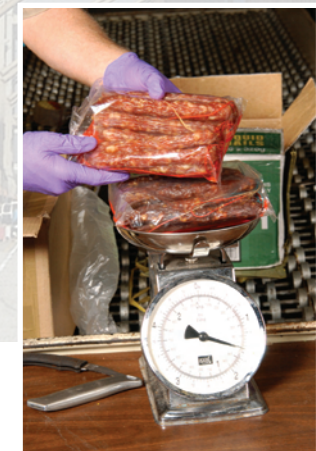
Prohibited meat seized at a U.S. mail facility.