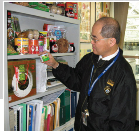
An AQI-VMO translates foreign labels of seized commodities, looking for prohibited ingredients.

Since the establishment of the U.S. Department of Homeland Security (DHS) in 2003 to create a consolidated border-inspection organization, DHS' partnership with APHIS is extremely important in our exclusion efforts at America's borders. Although DHS' Customs and Border Protection (CBP) is responsible for protecting our Nation's borders, APHIS continues to determine what agricultural products can come into the country and what products pose a risk and should be kept out. APHIS' VRS program provides scientific advice and expertise to CBP regarding APHIS regulations for importing animal products and byproducts, international garbage, and related materials. VRS also serves as the liaison between CBP and other government agencies on matters related to the regulation of imported animals and animal materials.