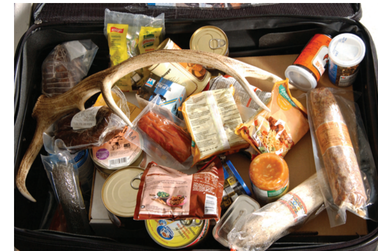
Although inspections like the one that netted this illegally imported material are now performed by DHS employees, APHIS still establishes, maintains, and enforces all regulations governing the import and export of certain agricultural products.