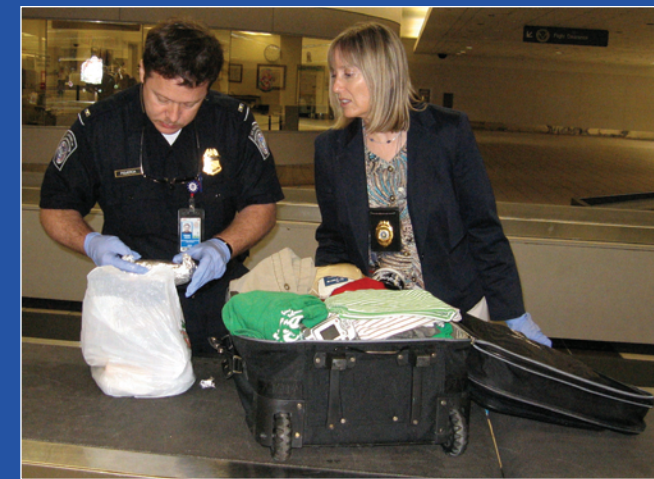
An AQI-VMO and CBP inspector examine the contents of passenger baggage for restricted agricultural commodities.

■ PPQ, Veterinary Regulatory Support Headquarters Riverdale, MD USDA-APHIS-PPQ-VRS 4700 River Road, Unit 129 Riverdale, MD 20737-1236 Office: (301) 734-7633 Fax: (301) 734-8538