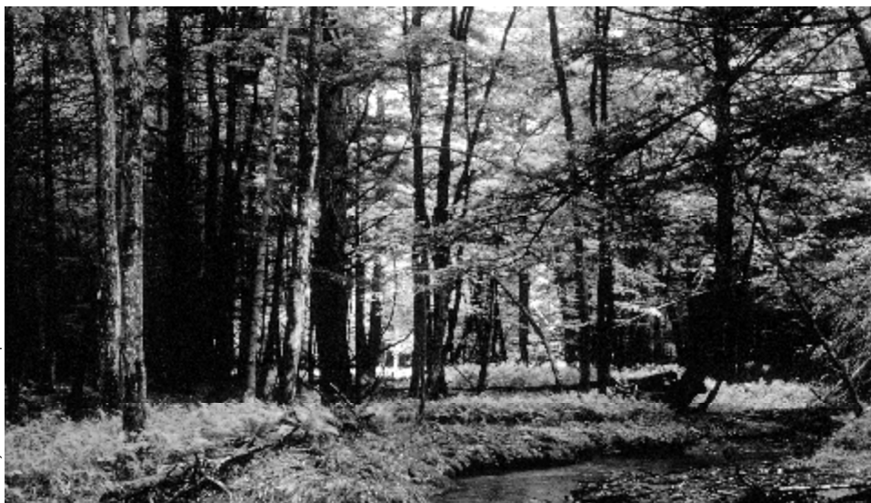
Certified hardwood forest, Kane, PA, that has been in continuous production for 150 years.

Are you planning some new construction or a remodeling project, putting in new wood flooring or buying new office furniture? You might consider purchasing “independently certified forest products.” These products originate from sustainable forests that have been certified by an independent third-party certification organization.