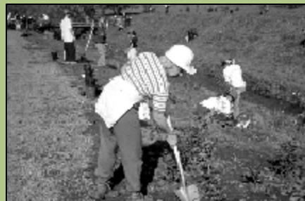
Volunteers help plant native trees and shrubs to protect water quality and improve salmon habitat along Des Moines Creek/the Sammamish River.

Businesses, along with community clubs and schools, can adopt restoration sites throughout King County. It's an opportunity for employees to enjoy the outdoors and make a contribution to the health of their watershed by performing a variety of duties such as planting native trees and shrubs, controlling invasive weeds and monitoring wildlife use of the site at their own convenience. King County provides a selection of sites, a site visit, training and support to make the site thrive. For more information, contact Michael Murphy at 206/296-8312 or via email at michael-wlr.murphy@metrokc.gov .