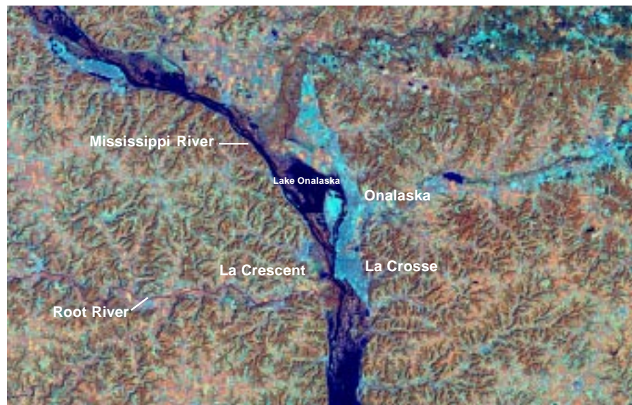
Figure. A false color infrared satellite image of Lake Onalaska, Pool 7 of the Upper Mississippi River System. This image can be used as a backdrop to geographic information system (GIS) coverages, or simply plotted as a map. This graphic is available in color and expandable to 8" x 11" through the UMESC's Homepage at: http://www.umesc.er.usgs.gov/http_data/umesc_reports/umesc_prs.html .