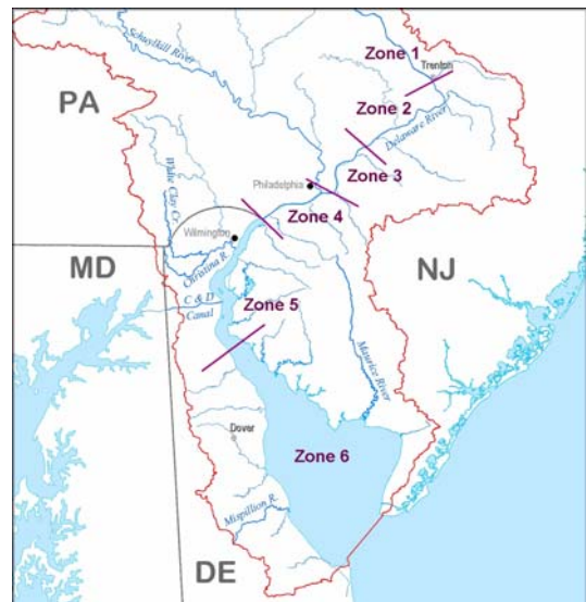
DRBC Water Quality Management Zones

A staged approach is being used to establish the PCB TMDLs. DRBC staff developed and calibrated a water quality model for one particular type of PCB (known as “Penta-PCBs”) that represents about one-quarter of the total PCBs present in the estuary. This, in turn, was extrapolated for total PCBs in order to develop the Stage 1 TMDLs. DRBC, EPA, and the