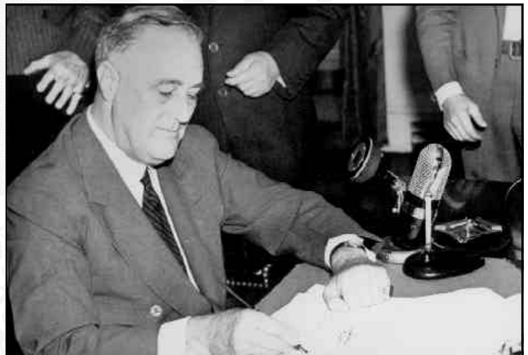
President Roosevelt signs the Selective Training and Service Act on Sept. 16, 1940, establishing the first peacetime draft and creating the Selective Service System.

Presently, male U.S. citizens, and male immigrants living in the U.S., who are 18 through 25, are required to register with Selective Service. As of Aug. 16, 2000, more than 43,257,793 young men have registered with the Selective Service System since registration was resumed.