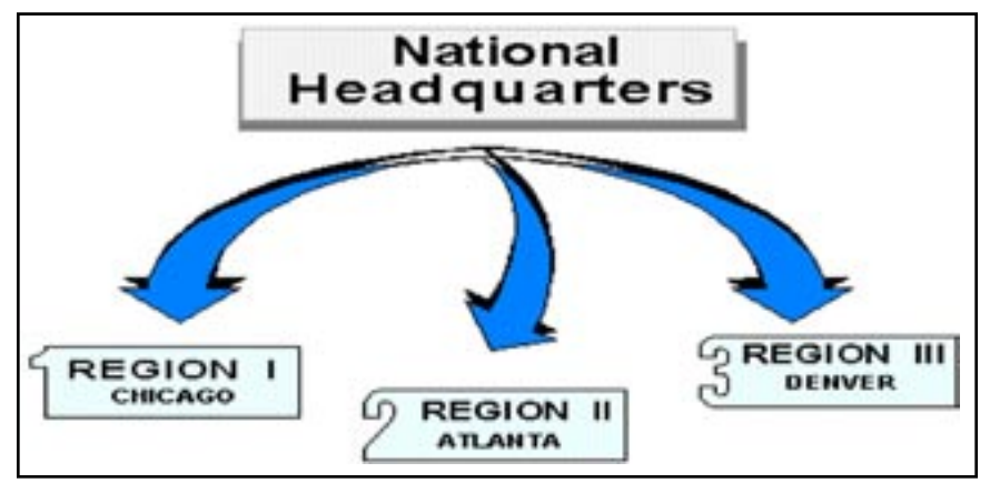
Figure 1 - Agency Structure

The current structure of the Selective Service System also includes three Region Headquarters. The National Headquarters and Region Headquarters make up the contingency of full-time employees of Selective Service. See Figure 1 below.