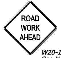
W20-1 See Note 4