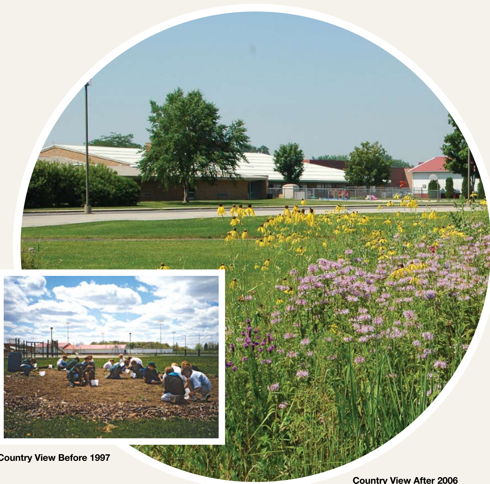
Country View Before 1997

We invite you to participate and begin the process of restoring sustainable native ecosystems on your local school grounds. Please pick up a brochure in the Conservatory building and/or go to www.uwarboretum.org/eps .