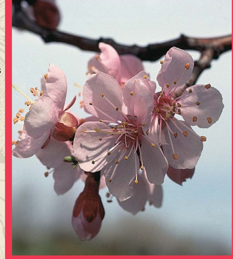
USDA-NRCS PLANTS Database / Herman, D.E. et al.

been modified to be more petal-like. While hybrid roses are a feast for human eyes, they are famine for pollinators!