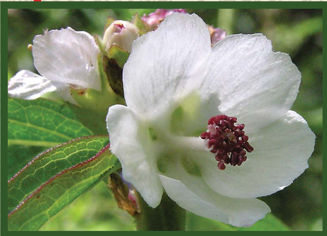
Al Schneider @ USDA-NRCS PLANTS