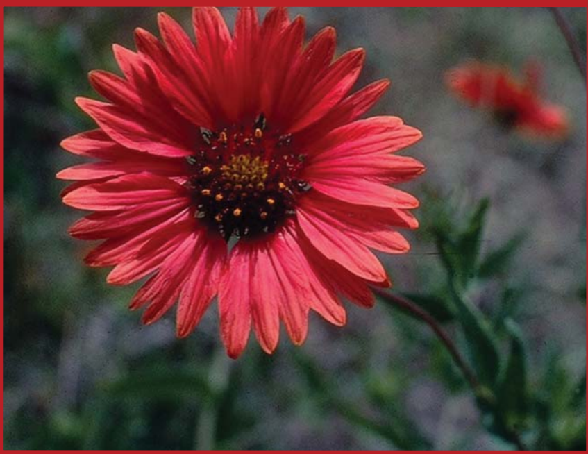
Clarence A. Rechenhain @ USDA-NRCS PLANTS