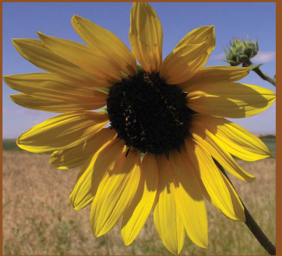
Al Schneider @ USDA-NRCS PLANTS

Familiar to all gardeners is the aster or composite family, containing such favorites as marigolds, zinnias, sunflowers, and asters, along with ever-present weeds like the dandelion. It vies with the orchids for the reputation of being the largest family of flowering plants. The composites comprise in excess of 20,000 species and are distributed worldwide.