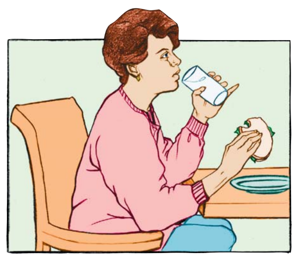
Sipping liquids with your meals will make eating easier.