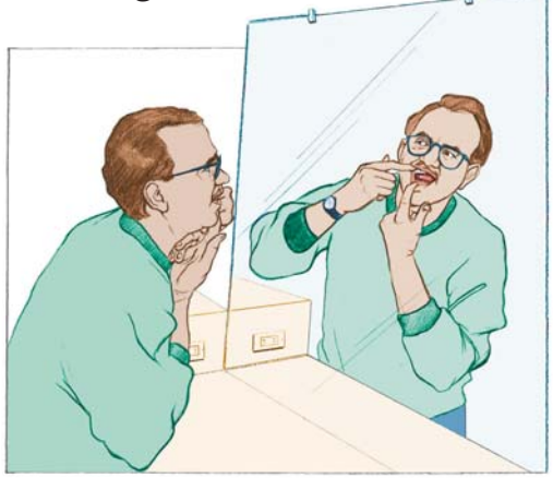
You can see or feel most of these problems. Check your mouth every day.