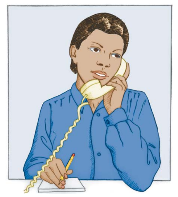
Call your cancer doctor or dentist if you have any mouth problems.