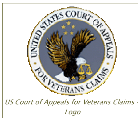
US Court of Appeals for Veterans Claims – Logo

"In furtherance of its mission, the Court also seeks to help ensure that all veterans have equal access to the Court and to promote public trust and confidence in the Court."