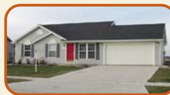
Home in St. Joseph