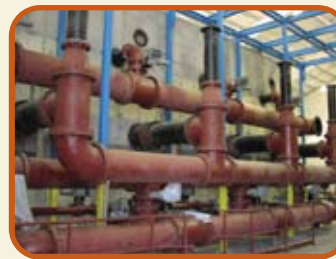
Gateway Regional Water Co.