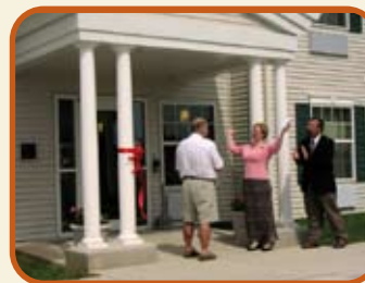
Nauvoo Family Inn & Suites