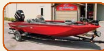
Olmstead rescue boat