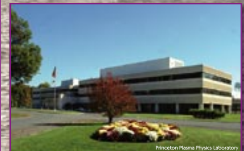
Princeton Plasma Physics Laboratory

CANCELLATIONS: If it is necessary to cancel a session due to snow or ice storms, a message will be left on the Science-on-Saturday Hotline.