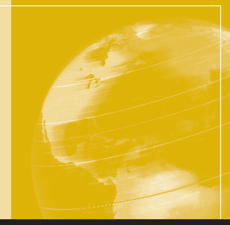
U.S. TRADE AND DEVELOPMENT AGENCY