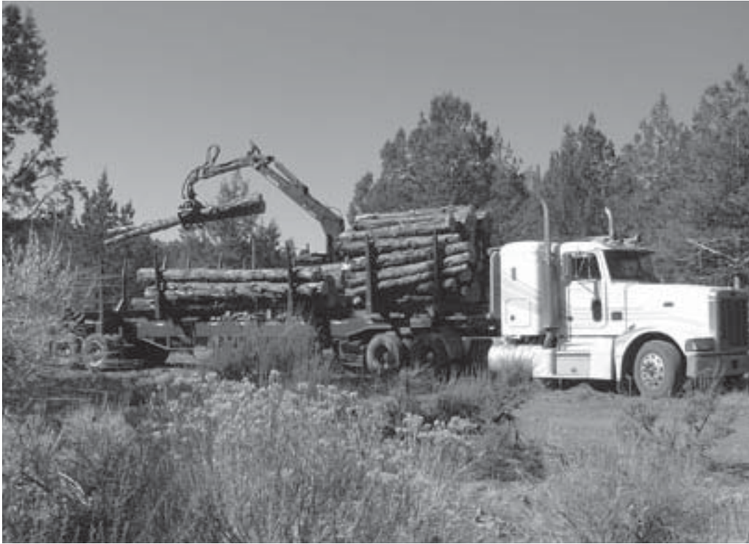
Juniper Logging