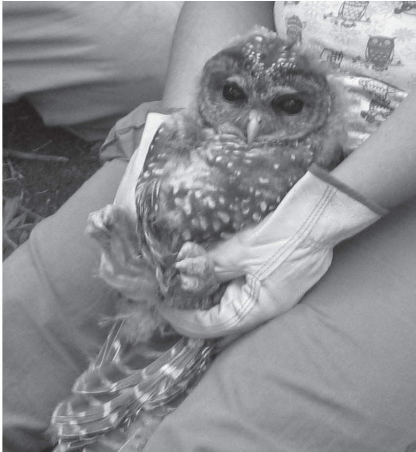
Banding a Northern Spotted Owl

Of the fifteen sites surveyed/monitored, seven were occupied with northern spotted owl pairs. One new pair was located in 2007. Barred owls were documented in five locations and are known to occupy two northern spotted owl nest territories.