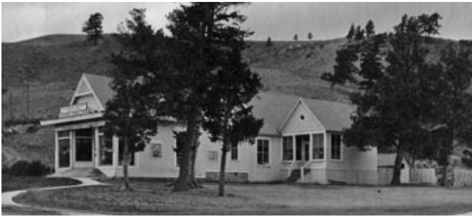
YELLOWSTONE ARCHIVES, YEL 23430