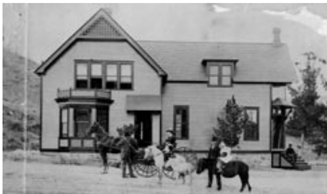
YELLOWSTONE ARCHIVES, YELL 30313

The new store, located between the Cottage Hotel and the National Hotel, opened in 1896, probably in the spring to be ready for the summer's onslaught of eager tourists. The enterprise was known as "Ash & Henderson," and their letterhead proclaimed sales of "Dry Goods, General Merchandise, Clothing, Boots & Shoes," and of course curios and photographic views; in other words, a variety of items that defined a "general store." 57 The building was a nice-looking, two-story frame structure with the residence on the left side, facing the main road. It measured 25' by 40', and that portion of the building (today's Yellowstone General Store) still looks much the same as it did in 1896. The store section of the building was 20' by 29', and faced the National Hotel. 58 Although George Ash originally made the application for the lease, officials issued it in Jennie's name, and most of the business correspondence in the files originated with her. Business letterhead from 1902 advertised her as Manager, and the business became known as J.H. Ash & Company by 1907. 59 George Ash may have assisted in the operation in the beginning, but he later seems to have remained behind the scenes.