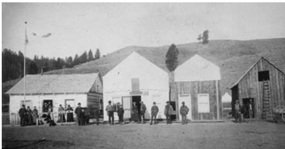
The Post Office Store, circa 1880. The second building from the left has a sign above the door reading "Post Office." The first building on the left may have been used as a residence.