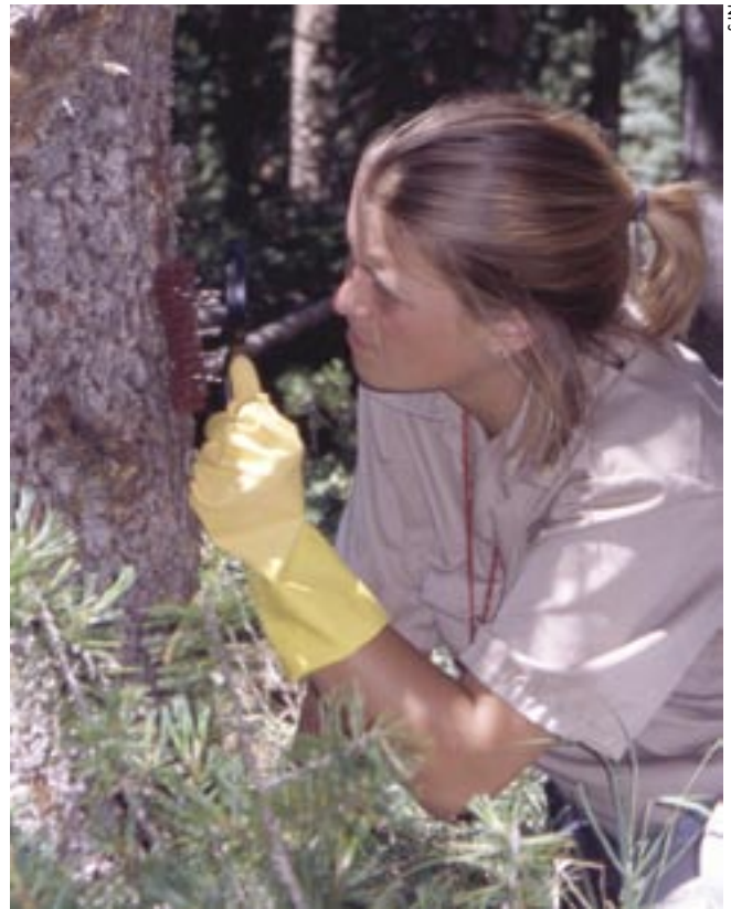
A Youth Conservation Corps volunteer assists the lynx crew by checking a hair snare pad for snagged hairs.

Snowshoe Hares in Yellowstone The Elusive Canada Lynx Yellowstone's First General Store