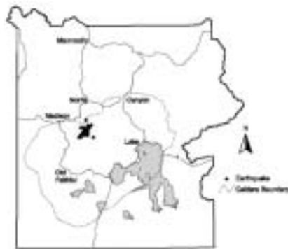
Location of January 15, 2002, earthquake swarm. Map by Henry Heasler.

For real-time seismic data for Yellowstone visit: www.seis.utah.edu/reactivity/recent.shtml ; for crustal motion data from the Yellowstone GPS (Global Positioning System) monitoring network visit: www.mines.utah.edu/~rbsmith/RESEARCH/UUGPS.html .