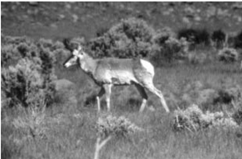
Pronghorn antelope.

Although dramatic ecological change does not appear to be imminent, it is not too soon for the managers of YNP and others to start thinking about how to deal with potential changes. Before humans modified the landscape of the GYE—limiting access to much of it and interrupting migration routes—animals could respond to environmental changes by moving to alternative locations. To a lesser degree, and over longer time frames, plants could adapt as well, especially in places with significant topographic relief. But many options that organisms formerly had for dealing with environmental changes have been foreclosed because of human development of the region. Human-induced climate change is expected to be yet another long-term influence on the ecosystem. Reconciling the laudable goals of preserving ecosystem processes and associated ecosystem components with human interests and influences on wildlands will be a growing challenge in the future, not only in the GYE. That reconciliation will involve conflicting policy goals, incomplete scientific information, and management challenges. Resolving these conflicts will require all the vision, intellectual capacity, financial resources, and goodwill that can be brought to bear on them. 🌍