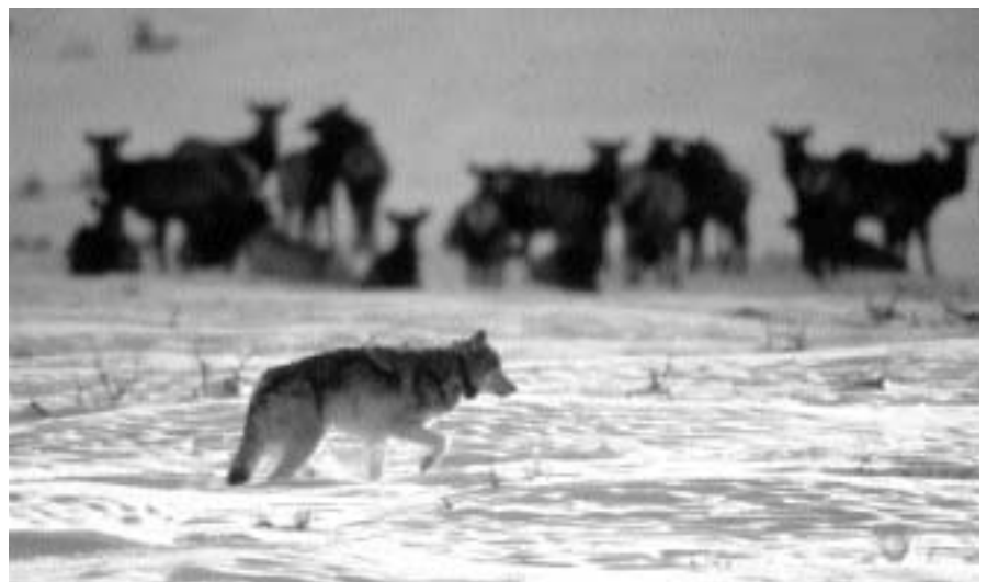
A radio-collared wolf stalks elk.

A second recurrent theme in our report has been the importance of spatial scale. The northern range is an incomplete ecosystem for large herbivores that rely on heterogeneity in the distribution of foods that vary seasonally in abundance, quality, and availability. A large spatial extent provides reserve areas that may not be preferred during normal years but can be used during times of shortage. The importance of the heterogeneity that normally accompanies a large spatial extent was emphasized by Walker et al. (1987), who examined drought-caused mortality of ungulates in African reserves that varied in size from 442 to 19,000 km 2 . Mortality was relatively low in the large reserves because animals expanded their normal range and used reserve areas that were far from normal water sources during droughts. Walker et al. (1987) concluded that culling was unnecessary if there was sufficient spatial heterogeneity to provide reserve forage. Similarly, during severe winters ungulates in the northern range use areas outside park boundaries. However, many of these key areas are not