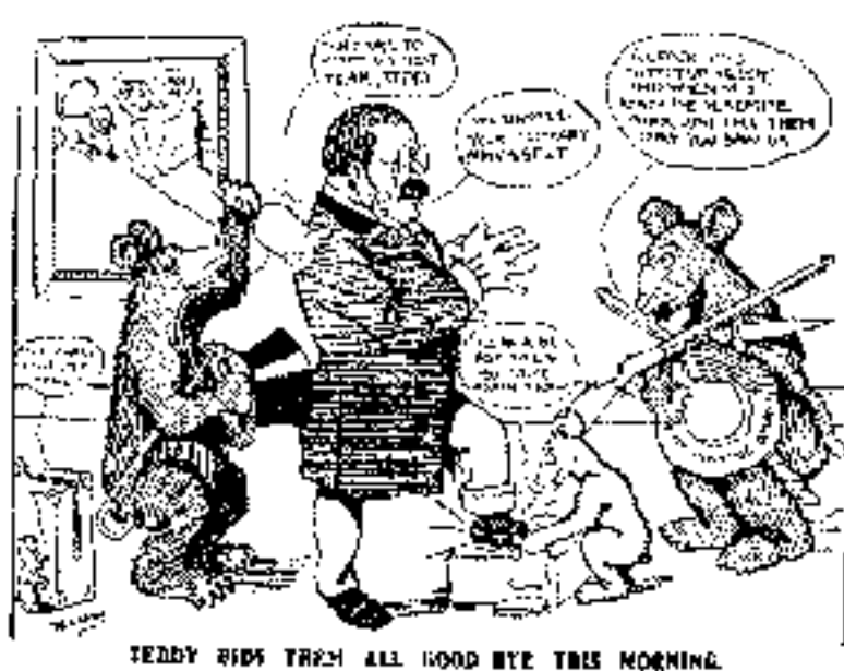
An editorial cartoon's depiction of Roosevelt's 1903 Yellowstone visit. Note the mountain lion perched outside the window.

Although the hunting of many ungulate species ended in 1883 by a directive of the Secretary of the Interior, park officials continued killing predators throughout the end of the 19th century and into the early 20th century. Many