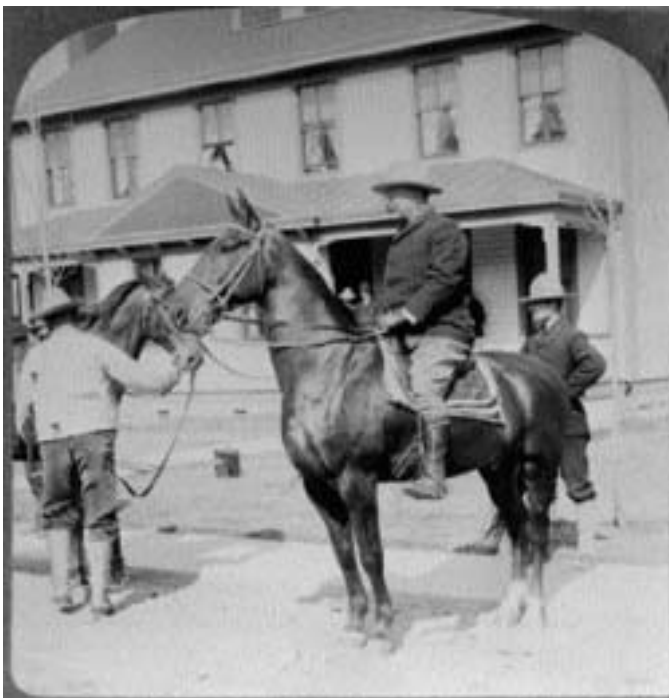
T.R. on Officer’s Row in Mammoth, 1903.

In 1919, Roosevelt passed away at his home at Sagamore Hill, New York. With his death, Yellowstone lost not only one of its most important defenders, but also one of its early wildlife managers. Roosevelt’s handling of predators in Yellowstone will always be debated as having been good or bad. Yet one thing is clear: Roosevelt attempted to establish policies that he believed were in the park’s best interest as he understood it at the time. Unfortunately, he did not understand many of the environmental changes that were occurring in Yellowstone, nor did he recognize how drastically the environment had been changed by those before him, especially how much damage had been done to the predator populations. He also believed that the natural increase of the elk populations and the effects of winter kills, which are now recognized as part of the natural process in Yellowstone’s ecosystem, were inhumane and needed to be managed with what he viewed as more humane methods. Despite these shortcomings, Roosevelt’s changes to Yellowstone’s predator control policies were fairly advanced for his day and age. Roosevelt must be given credit for his effort to look beyond the image of