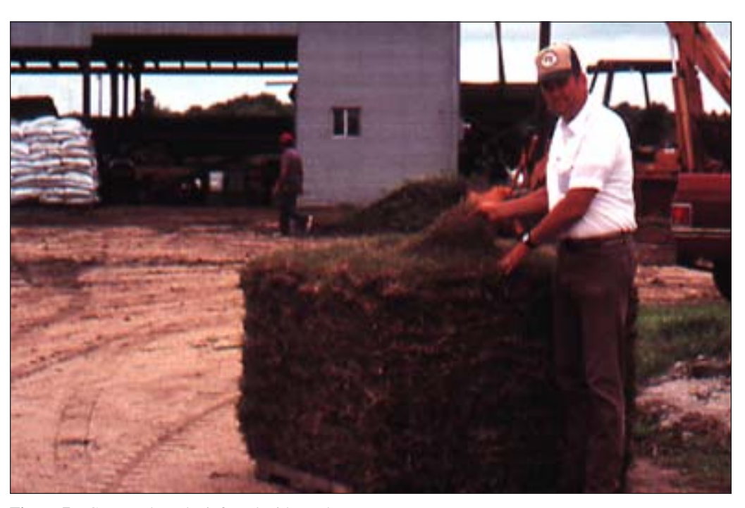
Figure 7 —Grass sod can be infested with newly mated queens as well as entire fire ant colonies.

Procedure —Apply a single broadcast application of chlorpyrifos with ground equipment (fig. 7) or apply two sequential broadcast applications of granular fipronil. Immediately after treatment, apply at least 1.5 inches of water to treated areas.