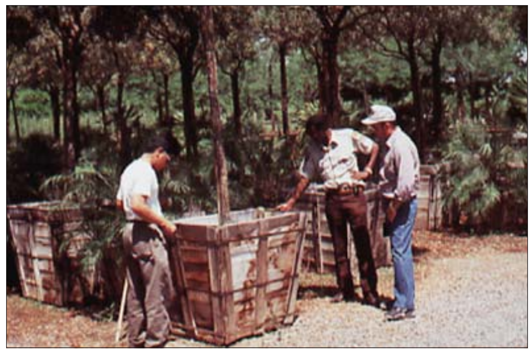
Figure 5 —State plant regulatory officials inspect nursery stock and enforce the Federal IFA quarantine.

Nurseries participating in this program will also be inspected by Federal or State inspectors at least twice a year. More frequent inspections may be necessary depending upon IFA infestation levels immediately surrounding the nursery, the manage-ment's thoroughness in maintaining the premises, and the number of previous detections of IFA's in or near containerized plants. Inspections by Federal and State inspectors should be more frequent just before and during the peak shipping season. Any nursery determined to have IFA colonies must be immediately treated to the extent necessary to eliminate all detectable colonies.