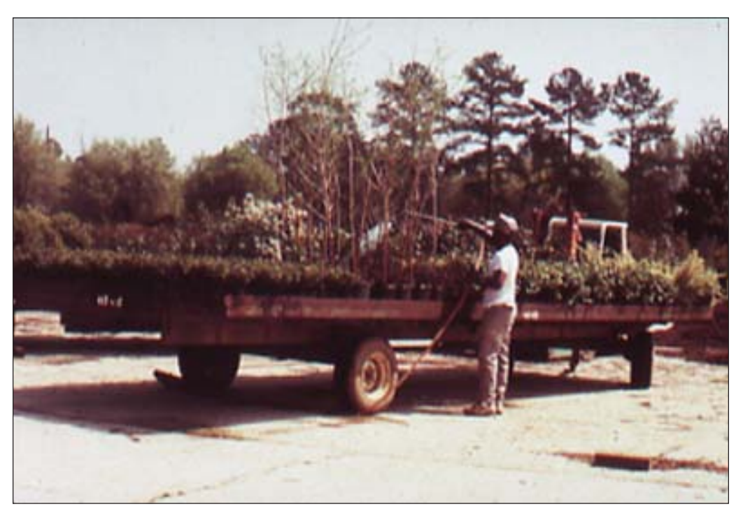
Figure 3 —This nursery worker is drenching containerized plants.