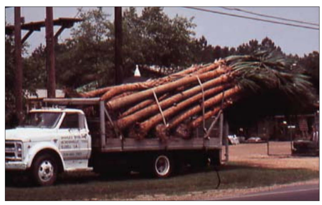
Figure 6 —The new owners of these large palm trees can be confident that they were shipped from an IFA-free nursery.

2. Control —Nursery plants that are shipped under this program must originate in a nursery free of the IFA (fig. 6). Nursery owners must implement a treatment program with registered bait and contact insecticides. The premises, including growing and holding areas, must be maintained free of the IFA. As part of this treatment program, all exposed soil surfaces (including sod and mulched areas) on property where plants are grown, potted, stored, handled, loaded, unloaded, or sold must be treated with a broadcast application of bait at least once every 6 months. The first application is more effective when applied early in the spring. An early spring bait application provides control before winged queens are produced or have time to establish new colonies. Follow label directions for use.