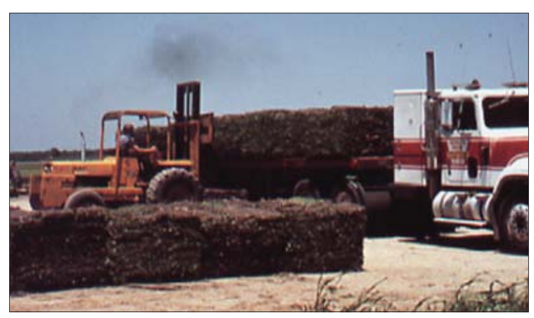
Figure 2 —Sod is frequently shipped from turfgrass farms inside the IFA quarantine area to places where fire ants have not yet become established. Regular field monitoring and a close look at each outgoing shipment can help reduce the likelihood of spreading fire ants to new areas.

Certificates authorizing movement of regulated articles are issued by quarantine officials when certain approved procedures have been utilized to ensure that the regulated article(s) are free from imported fire ant infestation. See page 19 for a complete listing of State regulatory officials and U.S. Department of Agriculture (USDA) State Plant Health Directors.