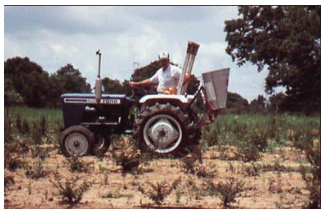
Figure 4 —Field-grown nursery stock can be certified for shipment based on in-field treatments with baits used in combination with granular chlorpyrifos.

Certification Period —12 weeks; an additional 12 weeks of certification can be obtained with a second application of granular chlorpyrifos.