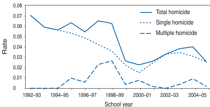
FIGURE. Total, single-, and multiple-student school-associated homicide rates* among students aged 5–18 years, by school years — United States, July 1992–June 2006

Overall rates of school-associated student homicide during July 1999–June 2006 are lower than those reported when the SAVD study was first conducted (July 1992–July 1994). Data for 1999–2006 have patterns that are similar to those documented previously, with substantially