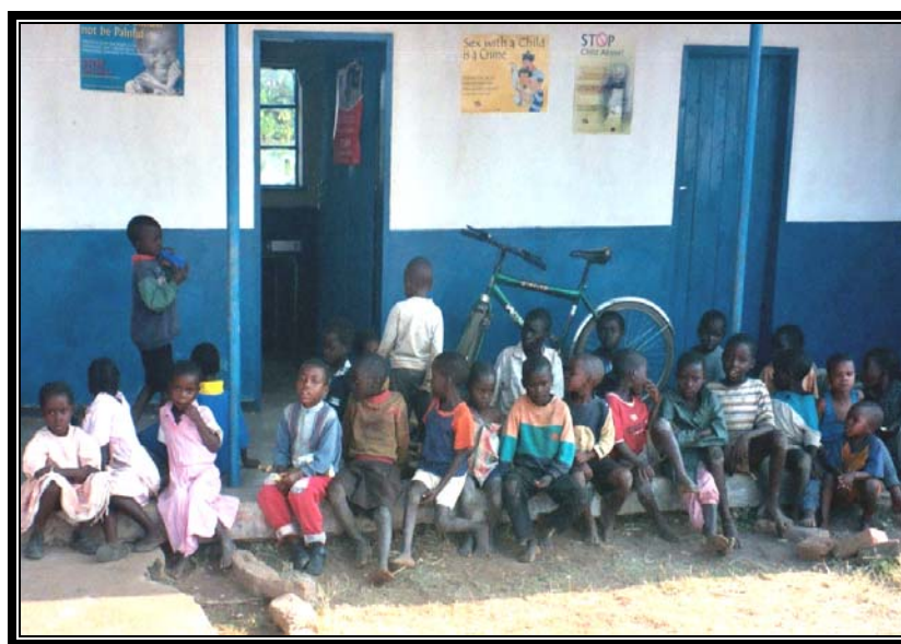
Students in front of JCM school

JCM's goals for the cooperative agreement consists of: (1) Making parents, teachers, and community members aware of the importance of education and the negative effects of child labor; (2) Strengthening transitional education systems; (3) Sensitizing national institutions that make policy on child labor and education; and (4) Sustaining the JCM vulnerable children program on a long term basis. To achieve these goals, JCM uses ILAB's Education Initiative funds to operate eight transitional schools in the Copperbelt Province, Eastern Province, and Lusaka Province. (See Exhibit C for a map of Zambia.)