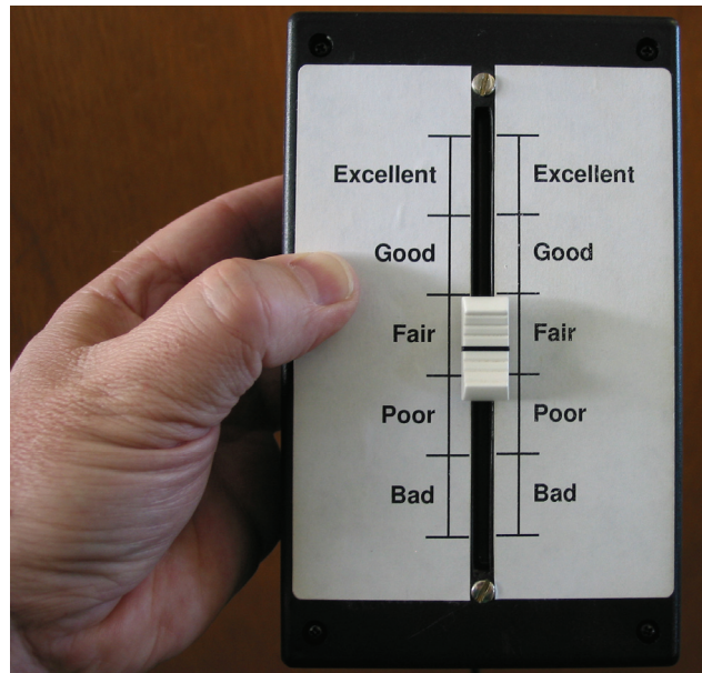
Figure 1. SSCQE Slider.

Lower bit rates (2-8 Mbits/sec) were paired with the newer DivX and WM9 encoders (codecs 1 and 2) while higher bit rates (6-19 Mbits/sec) were paired with the MPEG-2 encoders (codecs 3 through 5). Codecs 1 through 4 were operated at three different bit rates each, for a total of 12 video systems. Codec 5 (which could interface with the 8-VSB RF transmission hardware) generated the remaining 4 video systems, 2 of which had RF transmission errors. These two systems included Advanced Television Systems Committee (ATSC) 8 Vestigial Sideband (8-VSB) Radio Frequency (RF) modulation and transmission over a poor signal-to-noise ratio channel, which caused signal drop-outs in the decoded TV picture.