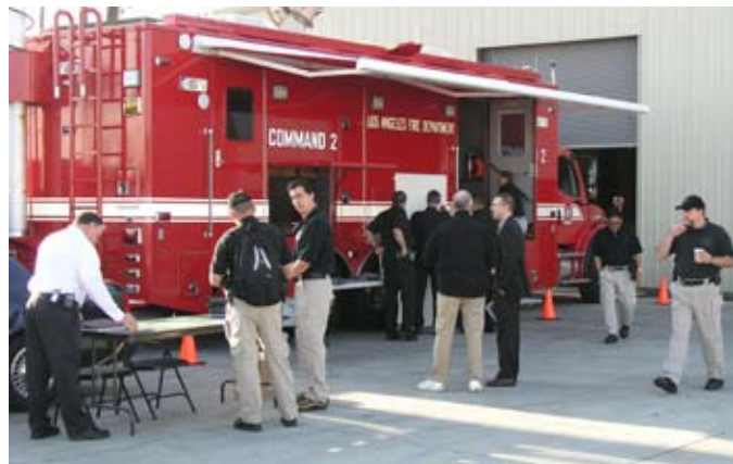
A tactical plan validation exercise in Los Angeles, California

from around the country. The panels gathered to review the TICIPs and assess the real-world feasibility of each. Following approval from the panels, the sites are required to validate the TICIP through a limited full-scale exercise. All 75 UASI sites are required to hold an exercise that illustrates the region's communications interoperability by fall 2006. The focus of the exercise is on availability, coordination, and integration of systems that the various agencies would experience in response to a multi-jurisdictional event.