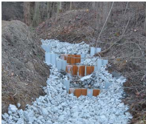
Limestone Diversion Channel with Waterfalls for aeration

Lambert Run Restoration Project, West Virginia - Treatment of the water relied on a passive system consisting of wet-sealing a partially collapsed portal, installing an open limestone channel with waterfalls to convey the mine drainage, two constructed wetlands, and a steel slag leach bed to add alkalinity to the system. The project used approximately 168 tons of steel slag and 567 tons of limestone.