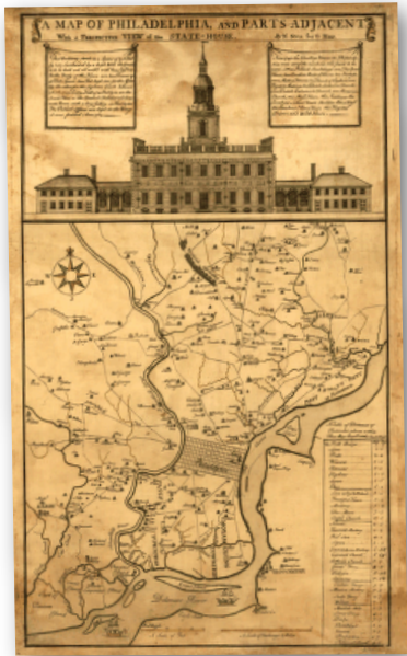
Nicholas Scull. A Map of Philadelphia and Parts Adjacent . [Philadelphia : 1752]