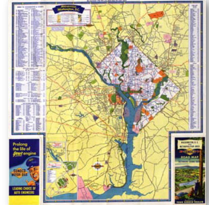
Rand McNally. Washington, D.C. and Metropolitan Area, Sunoco Road Map . Chicago : 1950. This is one of 16,000 maps from the Peterson Road Map Collection.