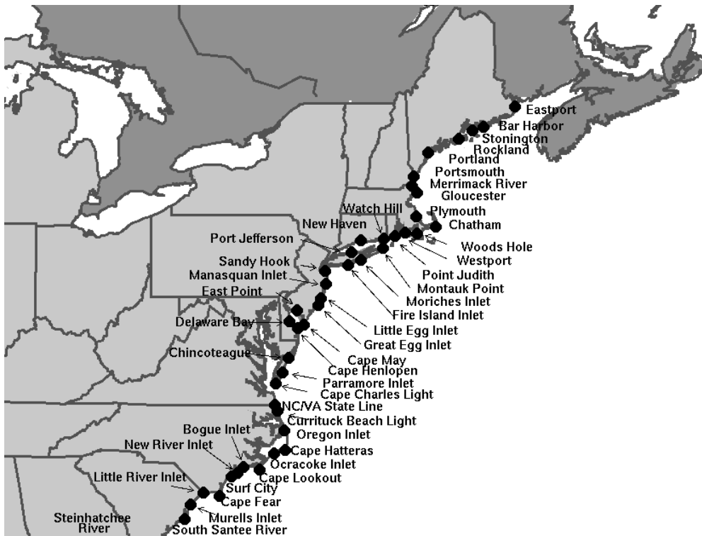
Figure B-1. Tropical Cyclone Break Points for the Northeast