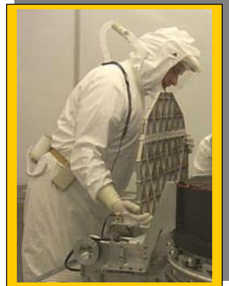
Johnson Space Center

The major source of contamination in the cleanroom originates from the workers. So, if the workers are not properly gowned all the time, the money spent to develop a cleanroom is wasted. Airborne micro-organisms, which are almost exclusively bacteria, are normally dispersed into the air around us from the surfaces of our skin cells. Cleanroom garments help to eliminate this source of contamination by acting as a "person filter" to prevent human particulate matter from entering the atmosphere of the cleanroom.