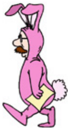
A cleanroom scientist wears a bunny suit.

*Why is it called a bunny suit? There is no hard data to tell us who coined the term or when it was first used. However, speculation suggests that suiting up in the one-piece coverall is much like the suit many of us have seen as costumes and/or pajamas. It's big, it's one color, and it represents a bunny. And no, the cleanroom bunny suit does NOT have long ears and a fuzzy pink tail!