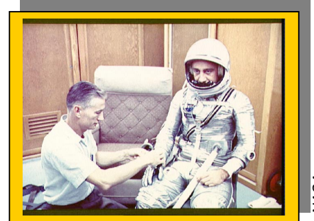
Astronaut Grissom dons a spacesuit for the Mercury-Redstone 4 mission.

But what does the evolution of jeans as first a work garment, and later an all-around item of clothing, have to do with suiting up for the Genesis cleanroom? Believe it or not, there is a connection. Just like Davis and Strauss designed jeans with rivets and from durable cotton to serve a specific purpose, so too did NASA when it designed its first space suit—not made of cotton—and later, when it designed the bunny suit for the Genesis cleanroom. Things like fabric, form, design, comfort, mobility, and practical use all played a part in the design of Davis’ jeans, and later, NASA’s spacesuits. For project Mercury, NASA’s first manned space flight program, NASA’s primary goal was to design a spacesuit that would protect the astronauts from the elements of outer space. Suits could be pressurized (inflated) if the spacecraft cabin decompressed.