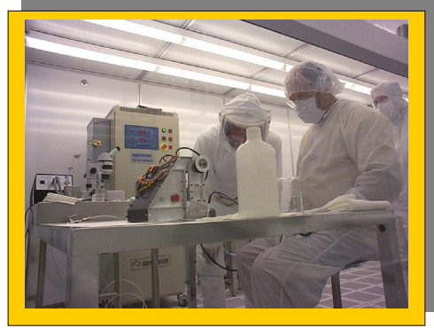
Johnson Space Center