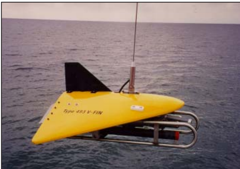
▲ The Plankton Survey System (PSS) is towed in a vertically undulating (tow-yowed) mode as the ship travels at about 2.5 m/s. Data collected will determine vertical structure of plankton and related physical variables along the ship's path.

Eleven of these sequential sediment samplers developed at GLERL will be strategically deployed in Lake Michigan offshore from St. Joseph and Michigan City to collect plume particles as they settle towards the lake bottom. The traps are programmed to collect 23 samples over a period of 10 days each.