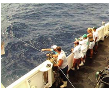
Various methods are used to collect fishery data