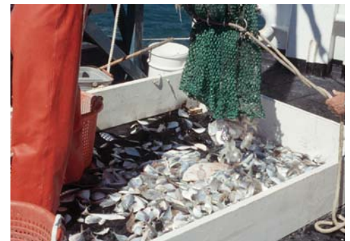
Fish caught during trawl operations are sorted, measured and recorded by NMFS scientists