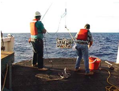
Deploying a camera