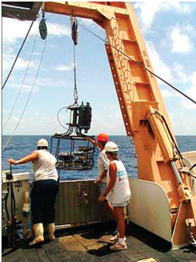
Collecting oceanographic data