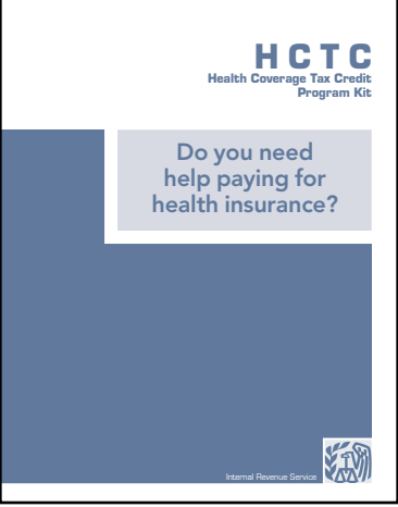
Figure 3: HCTC Program Kit Cover

The candidate completes and returns the HCTC Registration Form. Candidates must submit proof of health coverage, such as a copy of an invoice or letter from their HPA confirming enrollment.