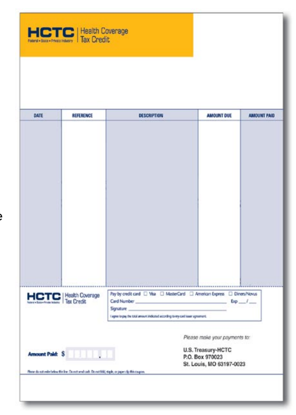
Figure 4: Sample HCTC Invoice

Note: The HCTC Program distributes invoices to participants monthly. The Program's billing is contingent upon a participant's eligibility for the tax credit. In other words, if a participant is no longer eligible for the tax credit, the HCTC Program will not mail an invoice to the participant and will not make a payment to the HPA.