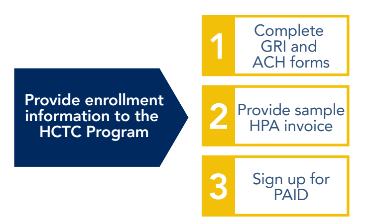
Figure 1: HPA Enrollment Steps

There are three steps to the HPA enrollment process. The first two steps are required in order to receive payments from the HCTC Program. The third step is optional.