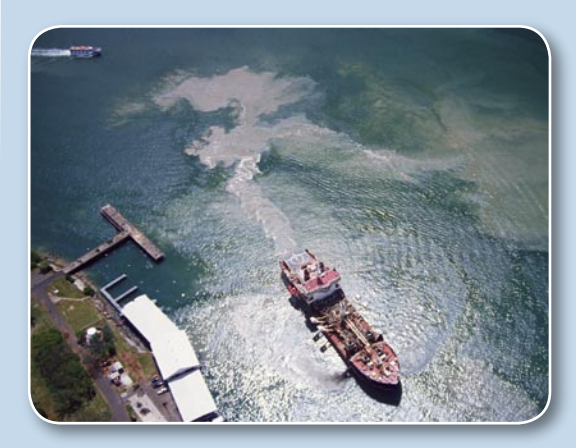
One major oil spill can cost millions of dollars and destroy fragile coastal ecosystems. PORTS® gives ship pilots real-time, accurate information to help them navigate crowded waterways and avoid accidents. When an accident does occur, PORTS® information is critical for rapid response and damage mitigation.

Guided by the mission of promoting safe and efficient navigation in US waters, the Center for Operational Oceanographic Products and Services (CO-OPS), part of NOAA's National Ocean Service, developed the Physical Oceanographic Real-Time System (PORTS®). PORTS® integrates and delivers environmental observations in real-time and through nowcasts and near-term forecasts to users in many of the nation's major ports. Using PORTS® information in conjunction with NOAA Nautical Charts and US Coast Guard (USCG) Navigational Aids has proven to reduce groundings. PORTS® data will be integrated with other operational data disseminated via the USCG Automated Identification System (AIS).