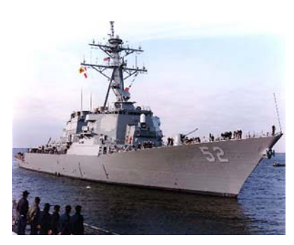
Phased array radar is currently used on Navy ships to support tactical operations.