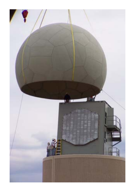
Installation of the SPY-1A antenna and radome on the NWRT

Phased array radar technology may help forecasters of the future provide earlier warnings for tornadoes and other types of severe and hazardous weather. Researchers are adapting the SPY-1 radar technology, developed by Lockheed Martin to support tactical operations aboard Navy ships, to weather detection. The phased array radar project has begun a new stage in NSSL's leadership in the research and development of future generations of weather radar.