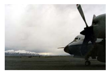
NOAA's P-3 aircraft flew into clouds where scientists could take direct measurements of the processes producing heavy snow.