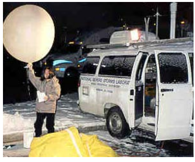
A University of Utah student prepares for a nighttime launch of a weather balloon from NSSL's mobile laboratory.