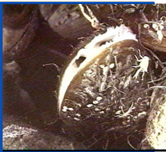
SEEP MYTILIDS, MUSSELS (M)