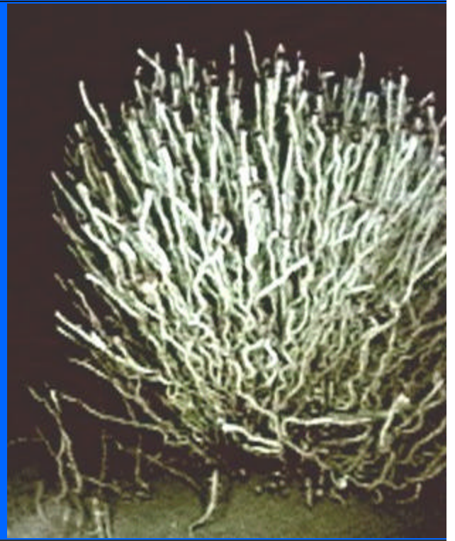
POGONOPHORAN TUBEWORMS (PG)