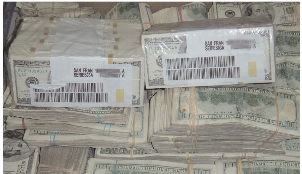
$4.7 million in seized smuggled currency—some still in their Federal Reserve wrappers. BSA reporting requirements force criminals to use risky and vulnerable methods to move and store their proceeds.

The Bank Secrecy Act (BSA) of 1970 introduced a number of monetary transaction reporting requirements designed to prevent criminal organizations from exploiting the U.S. financial system by moving and stockpiling their illicit funds. These reporting requirements are invaluable tools for law enforcement and are the backbone of the United States' anti-money laundering program. Each reporting requirement provides a layer of defense, and the Currency Transaction Report (CTR) is the first line of that defense.