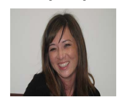
Stacy 2 Marketing Communications