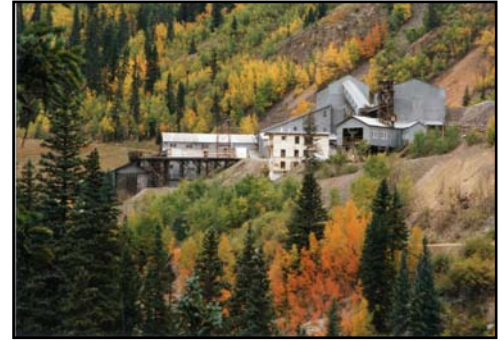
Shenandoah-Dives Mill Complex, Silverton, Colorado. The National Park Service performed a Level 3 HAER documentation of the Mill during the summer of 2005.