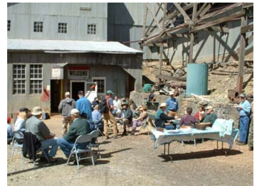
Lunch on-site at the mill.

The weeklong 2005 workshop hosted 15 participants and 8 presenters and consultants. The broad range of topics covered during the week allowed for a comprehensive understanding of the initial planning, documentation and assessment tasks associated with a project of this size, and significance. There was a general consensus from participants and presenters that the workshop was a tremendous success in its dissemination of the information presented in a community based educational experience offered through sharing the entire week in a team-building environment.