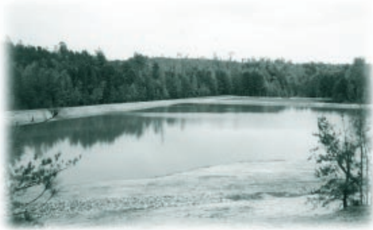
Before and after photos show the successful results of OSM's Cane Creek project (Walker County, Alabama). This project started in July 1997 and was completed in April 1998. Twenty miles of stream were improved, 20 acres of land were graded and reshaped, a pond dam was re-established, and portal and vertical openings were closed.

Goal: Better Protection - Protecting people, property, and the environment is measured by the number of times incidents occur outside the boundaries of the permitted areas being mined. These are known as offsite impacts and the goal is to have no incidents occur. In 1998, 93 percent of the mine sites were free of offsite impacts. In the future, OSM will be working with States, Tribes, and the coal industry to strive for, and maintain, a minimum number of occurrences.