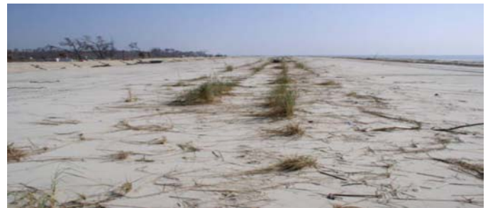
Fine's Plantings One Month After Katrina

"Before the hurricanes we had established three beach-dune-creation and stabilization planting sites and one sea oats evaluation planting," said Fine. "All survived the storms and an estimated 25-30 ft. storm surge. It is amazing but one of the few resilient remaining features along the coast is our plantings."