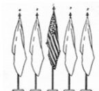
United States flag displayed in center of line.