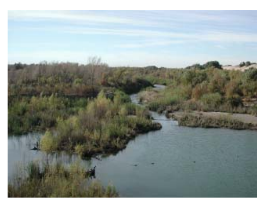
Colorado River downstream from Morelos Dam

The U.S. Section of the IBWC continued work on the Environmental Impact Statement (EIS) for the Lower Colorado River Boundary and Capacity Preservation Project. The purpose of the project is to preserve the international boundary where it is formed by the Colorado River and to improve the river's capacity to convey flood flows safely. The project alternatives consider different river alignments, dredging, and modification of the flood control levees. The USIBWC conducted various stakeholder meetings during the year to inform interested parties about the project and to seek their input. The two Sections of the IBWC continued project coordination in their respective countries. Once the U.S. Section completes the EIS required in the United States, both countries will implement the project jointly.