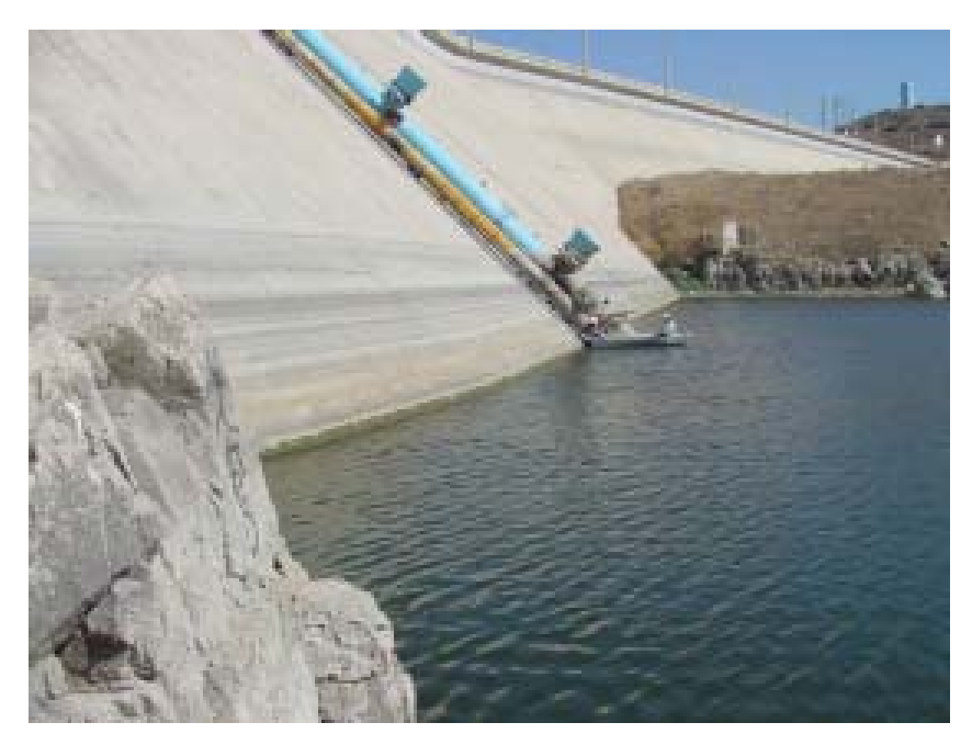
Installation of a telemetry system at Rodriguez Dam

Staff from both Sections of the IBWC also conducted quarterly inspections of the Tijuana River Flood Control Channel to determine the physical condition of the channel, identify tributaries to the channel, and estimate flow from the tributaries.