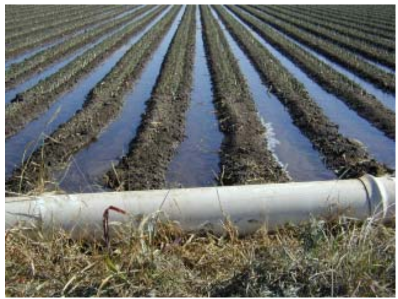
Conchos River irrigation conservation project

-- the Delicias District (005), Rio Florido District (103), and Bajo Rio Conchos District (090). Improvements that are planned are: lining of canals, installation of low pressure supply systems for application of water with multi-gate pipes, land leveling, installation of high pressure systems for drip irrigation and sprinkler systems, and rehabilitation of wet wells and pumping equipment. Completion of the projects and attainment of the projected water savings are expected to take four years. At the time of the engineers' visit, contracts under international funding had just been awarded and actual construction progress was minimal. However, projects undertaken with domestic funding by Mexico were already under construction.