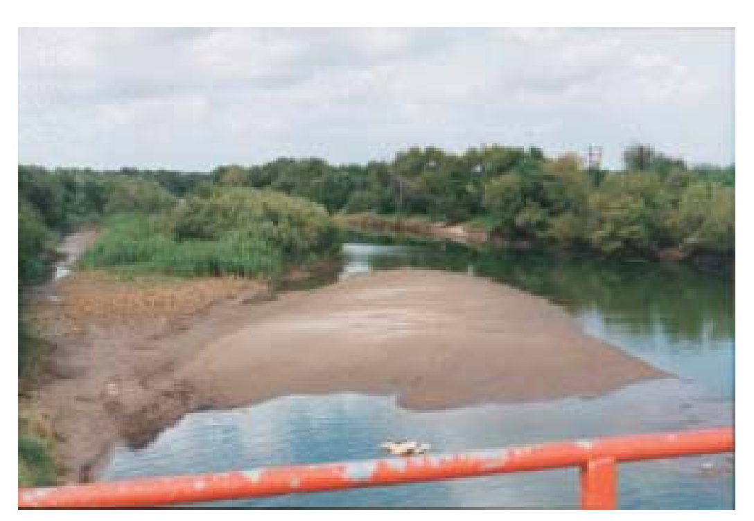
Sediment at Retamal Dam

The U.S. Section initiated an Environmental Assessment of the plan to remove sediment downstream of Retamal Dam, a Commission diversion dam designed to limit flood flows at Brownsville, Texas-Matamoros,