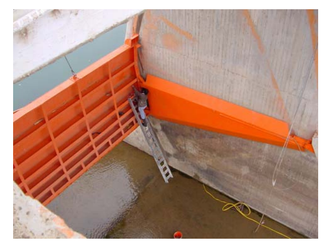
Morelos Dam maintenance

To effect these deliveries, the Commission operated and maintained the Morelos Diversion Dam near Yuma, Arizona-Los Algodones, Baja California, which diverts water into Mexico's canal system. IBWC personnel provided hydraulic supervision of the dam and conducted corresponding fieldwork to review facility operations. Additionally, the IBWC carried out rehabilitation works on 13 radial gates, including work on the gates' elevating mechanisms and modernization of the operating controls.