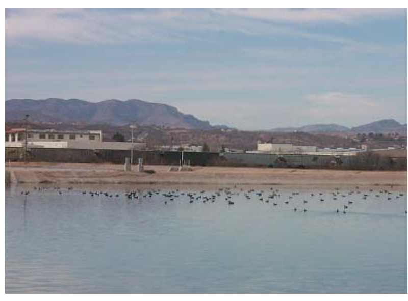
Nogales International Wastewater Treatment Plant

The Nogales International Wastewater Treatment Plant (NIWTP), located in Rio Rico, Arizona, treats wastewater from the Cities of Nogales, Arizona and Nogales, Sonora. The plant is jointly owned by the United States Section of the IBWC (USIBWC) and the City of Nogales, Arizona. The USIBWC operates the plant and receives reimbursement from Mexico for costs related to the treatment of sewage originating in Nogales, Sonora and from the City of Nogales, Arizona for treatment of its sewage.