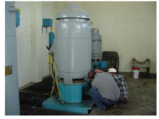
Morillo Drain pump

El Morillo Drain, located in the State of Tamaulipas, Mexico, is a binational project that conveys saline irrigation return flows to the Gulf of Mexico, thereby reducing the salinity of the Rio Grande. Consistent with the agreements in Minutes 223 and 303 of the International Boundary and Water Commission, maintenance and rehabilitation of the drain, pump station, and weir were carried out. These works consisted of clearing, grubbing, desilting, and replacement of slabs in some sections of the canal as well as general maintenance of the pump station building, pumps, control panel, and electrical sub-station, among other items. Funding for the project was shared among Mexico, the United States, and Texas irrigators.