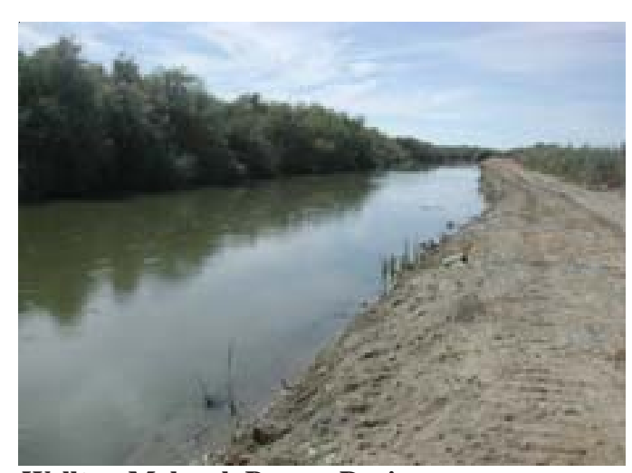
Wellton-Mohawk Bypass Drain

Based on joint field visits, the IBWC and Mexico's National Water Commission identified required maintenance works for the year and formulated, agreed to, and carried out the Wellton-Mohawk Drain maintenance program in order to assure the conveyance and diversion to the Santa Clara Slough in Mexico of saline agricultural drainage waters from the Yuma Valley. While the works were in progress, field trips were undertaken for the supervision of the works, which consisted of the removal of vegetation and weeds from the levees, clearing and grubbing the sides and bottom of the canal, and roadway maintenance. Additionally, the gates of the drain were replaced and their mechanisms rehabilitated.