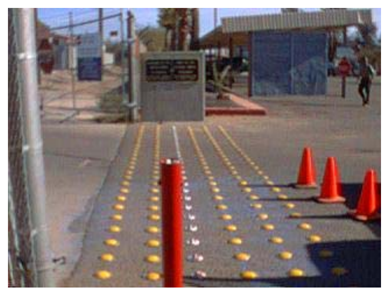
Boundary maintenance at the bridges and border crossings

Both Sections worked on inspecting the bridges and international ports for the purpose of observing the condition of the existing boundary demarcation features. Based on the inspections, the Commission undertook the maintenance of the demarcation features on all of the bridges and ports of entry between the United States and Mexico.