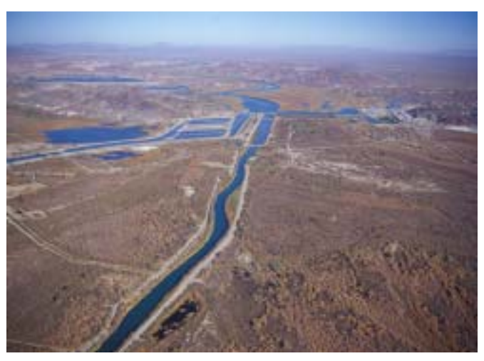
Aerial view of the All American Canal

Mexico, through the IBWC, has presented its view that the project would impact Mexico, affecting irrigated areas that depend directly or indirectly on seepage from the All-American Canal by reducing groundwater or increasing the salinity of groundwater.