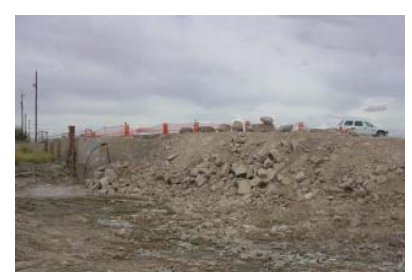
Work at Riverside Dam

Riverside Dam, constructed in the 1920s at El Paso, Texas-Ciudad Juarez, Chihuahua, served as a diversion dam and grade control structure for six decades until the dam failed during a 1987 flood. A temporary cofferdam was erected so that water could continue to be diverted into the adjacent U.S. canal. Over the years, silt accumulated in the main channel to the top of the cofferdam, posing a safety risk in the event of a flood. The affected parties in the United States and Mexico agreed that the old dam and temporary cofferdam were obstructing flows in the Rio Grande. In 2003, the United States Bureau of Reclamation (USBR) removed portions of the Riverside Dam and cofferdam, allowing planning to proceed for the removal of accumulated sediments and a permanent replacement structure.