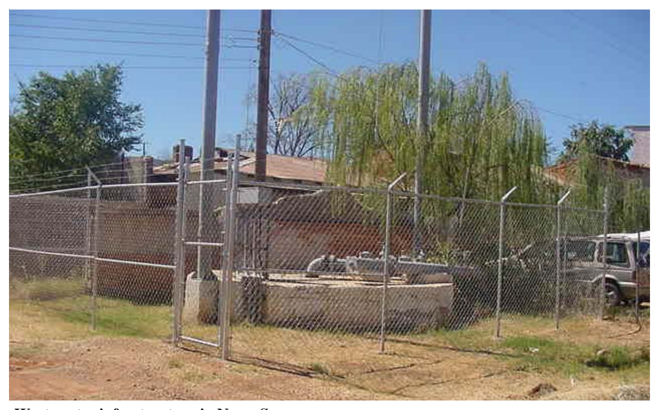
Wastewater infrastructure in Naco, Sonora

International Wastewater Treatment Plant. The committee includes representatives of the IBWC, the United States Environmental Protection Agency; the Arizona Department of Environmental Quality; the Arizona Department of Water Resources; the City of Nogales, Arizona; Mexico's National Water Commission; and the Potable Water and Sewerage Commission of the State of Sonora. To achieve its objectives, the committee reviewed and exchanged technical information, provided information to residents and businesses, and worked with industry.