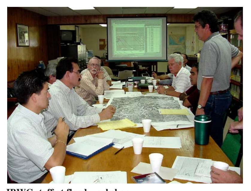
IBWC staff at flood workshop

The IBWC's Lower Rio Grande Flood Control Project provides flood protection along 180 miles (289.6 km) of the river, from the Gulf of Mexico to the area of Peñitas, Texas - Diaz Ordaz, Tamaulipas. Each country maintains an extensive system of levees to hold back high water. The project also includes Anzalduas and Retamal Diversion Dams and floodways in both countries.