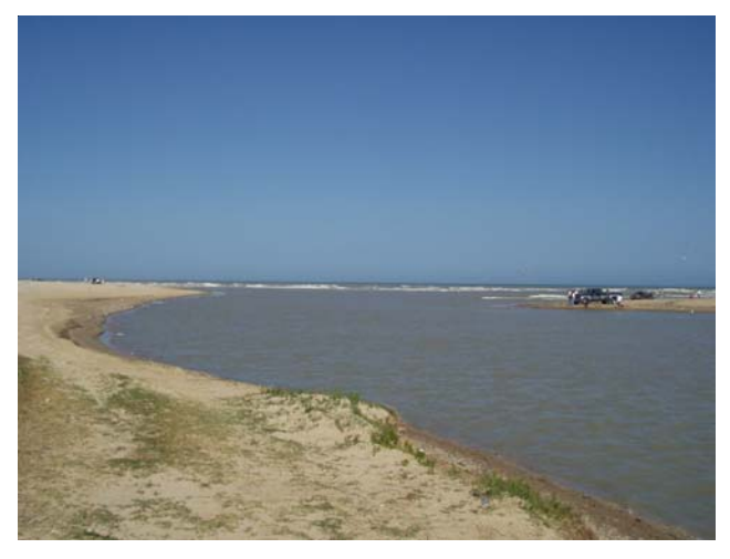
Mouth of the Rio Grande

The IBWC took action in 2003 to address concerns about the mouth of the Rio Grande. During portions of 2001 and 2002, the mouth, located at the Gulf of Mexico, was obstructed by a sandbar. To address this obstruction, federal agencies and both the U.S. and Mexican Sections of the IBWC conducted various inspections of the condition of the mouth and explored alternatives for maintaining flows at the mouth, including dredging, channel stabilization, and jetty construction. In the fall of 2003, sediment in the