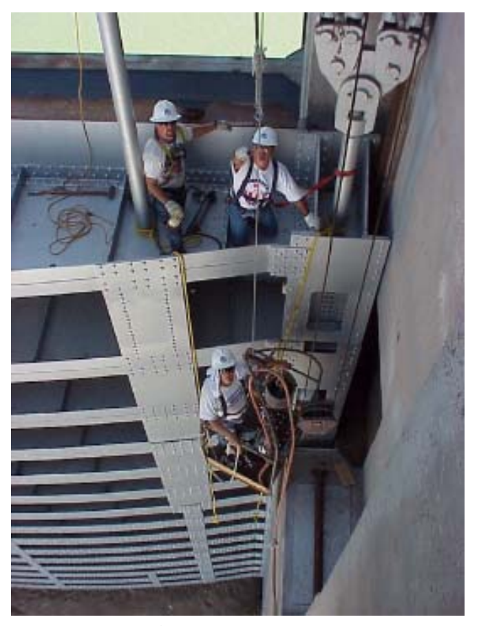
Falcon Dam spillway gate

The IBWC's other major dam, Falcon Dam, is located upstream of Roma, Texas-Miguel Aleman, Tamaulipas. Like Amistad Dam, Falcon provides water storage, flood control, and hydroelectric power generation for both countries. At the end of 2003, joint storage was 1,146,681 acre-feet (1,414.416 million cubic meters) or 43.2% of capacity, a