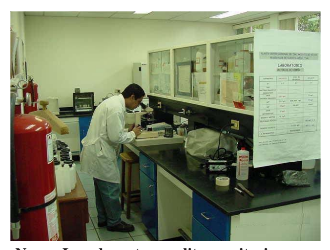
Nuevo Laredo water quality monitoring

The Commission completed and released a water quality report, "Binational Study Regarding the Intensive Monitoring of the Rio Grande Waters in the Vicinity of Laredo, Texas and Nuevo Laredo, Tamaulipas Between the United States and Mexico, November 6-16, 2000." The objectives of the study were to: 1) make a comparative analysis of water quality conditions in the Rio Grande; 2) enhance permanent water quality programs; and 3) measure the beneficial water quality effects of the Nuevo Laredo International Wastewater Treatment Plant (NLIWTP), which began operation in 1996. The study documents some ongoing water quality concerns in the Rio Grande while, at the same time, demonstrating the highly effective treatment of sewage provided by the NLIWTP.