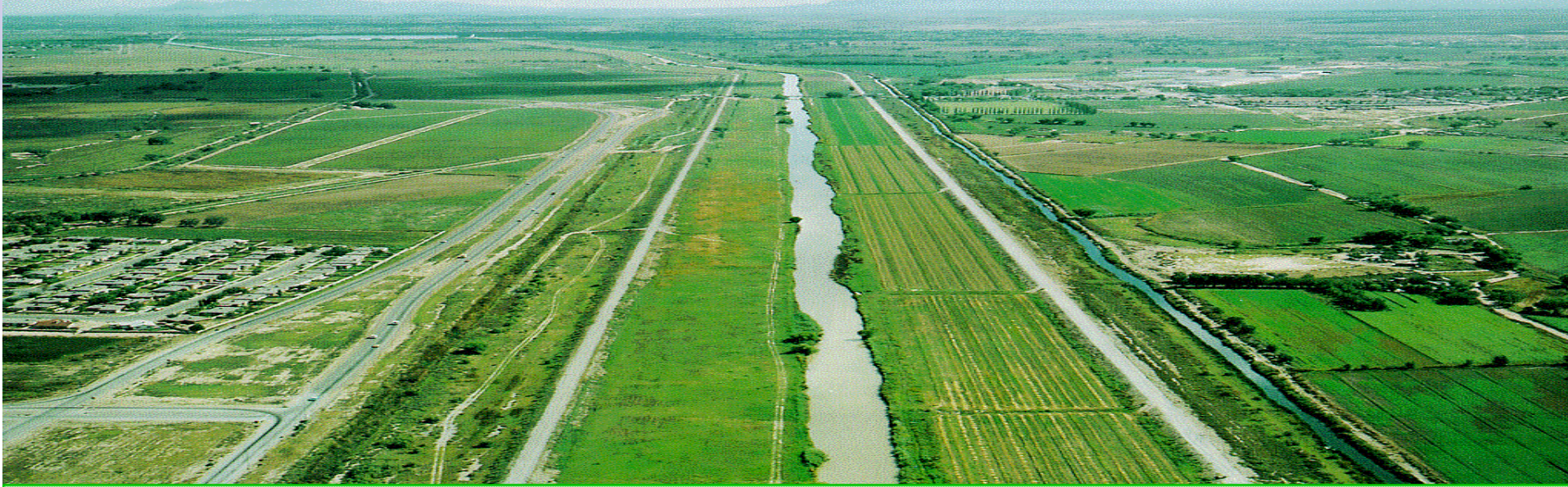
RIO GRANDE RECTIFICATION PROJECT IN THE EL PASO-JUAREZ VALLEY