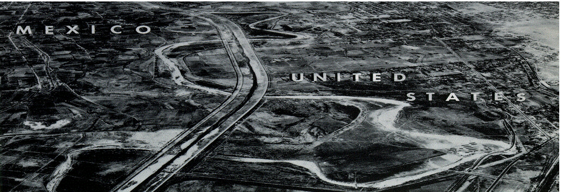
RIVER BED AND RECTIFIED CHANNEL