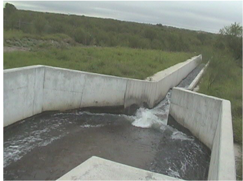
Nuevo Laredo TP effluent