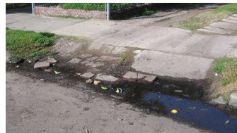
The Lodi Community Improvement Project aims to improve the infrastructure in most of Lodi east of Sacramento Street.

During a special City Council meeting, in which the council acts jointly as the Lodi Redevelopment Agency, members of the public will have an opportunity to voice their views on the proposed Lodi Commu-