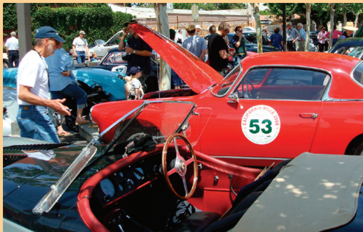
Rare, exotic automobiles on a four-day journey of Northern California attracted car enthusiasts to downtown Lodi Monday.

The event attracted hundreds of spectators downtown, with a group of schoolchildren shouting encouragement to arriving drivers.