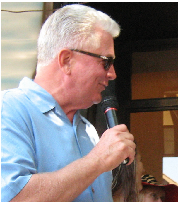
TV personality Huell Howser returned to Pine Street in Lodi on Friday for the dedication of a plaque commemorating the founding of A&W Root Beer.

Lodi wells to remove a now-banned vineyard pesticide from groundwater and is commonly used in other Central Valley cities where PCE is found. City residents and businesses pay a monthly water surcharge to fund the state-ordered cleanup.