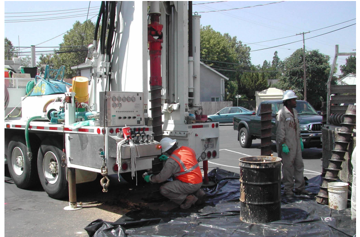
With the litigation near an end, Lodi can now focus its efforts on removing chemicals from the soil and groundwater.

The environmental engineering firm Treadwell &