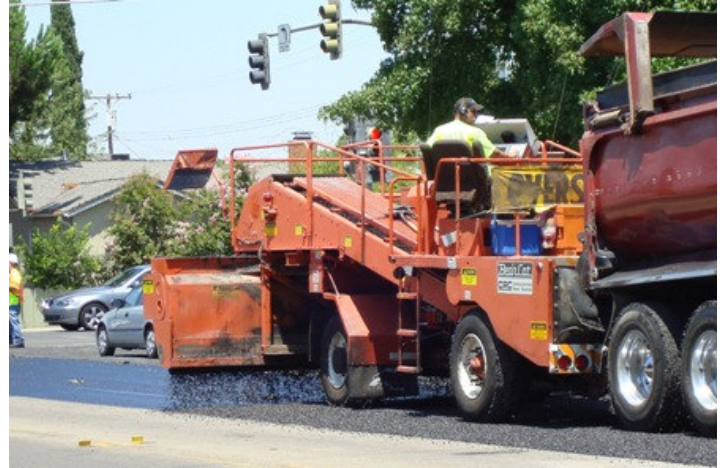
Workers place a layer of coated gravel onto a mixture of oil and rubber on Ham Lane as part of Lodi's recent road maintenance project.

Funds for the $1 million project came from the state's voter-approved Transportation Congestion Improvement Act and a $134,875 grant from the California Integrated Waste Management Board. Lodi recycled an estimated 11,239 tires in the project, reducing them to an oil base that