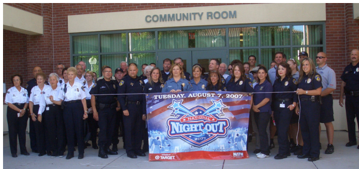
Members of the Lodi Police Department gather for the 2007 National Night Out. Lodi ranked seventh nationally for community participation.

National Night Out is designed to heighten crime and