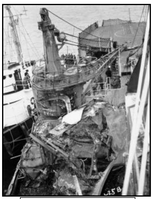
View of damage to the starboard side of the CGC EASTWIND