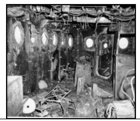
Fire damage to the Pilot House