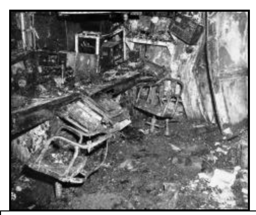
Fire damage to the Radio Shack