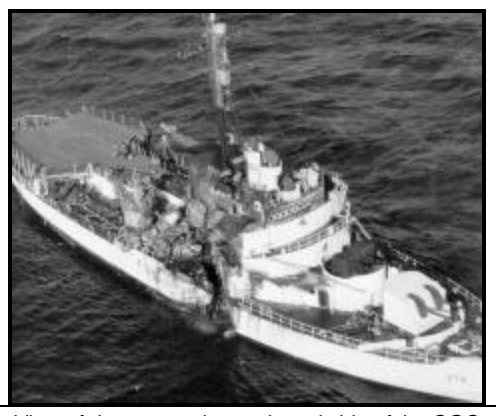
View of damage to the starboard side of the CGC EASTWIND as a result of its collision with the SS GULFSTREAM