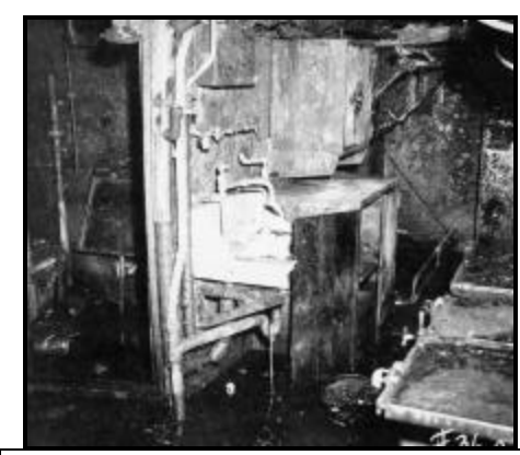
Fire damage to the Chief's Quarters