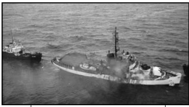
Damaged section of the CGC EASTWIND with the CGC GENTIAN & CGC SASSAFRAS standing by